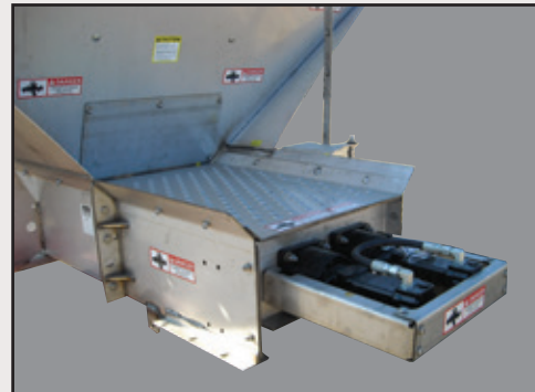
Dual Auger Bolt-On Tail Section