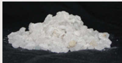
BEFORE Salt Slurry Generator