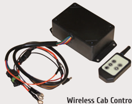
Wireless Cab Control with 10.5 HP Briggs & Stratton Engine