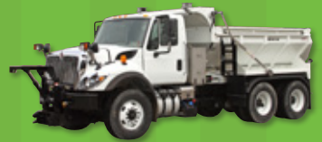
SPREADER | DUZMOR