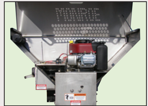
10.5 HP Engine