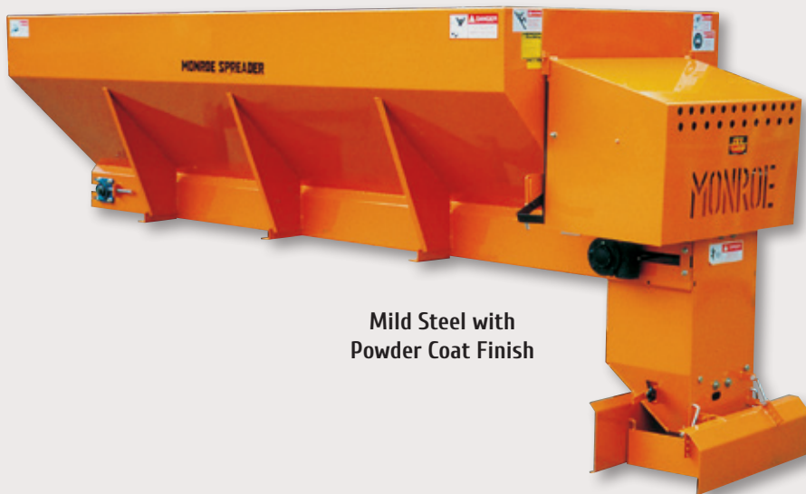
Mild Steel with Powder Coat Finish