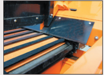
Bolt-On Chain Shields