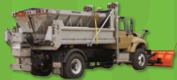
SPREADER | MCV