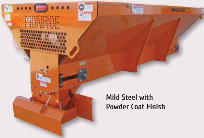
Mild Steel with Powder Coat Finish

10.5 Engine with Wireless Remote Control or Hydraulic Drive