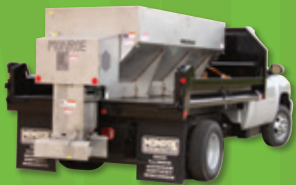
SPREADER | MSPV PICKUP