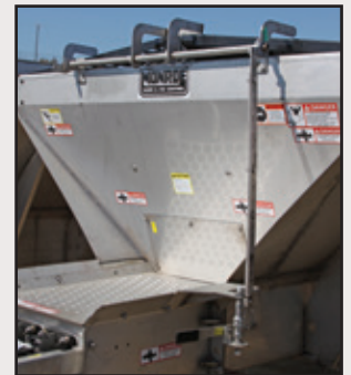
Hydraulic Interlock System