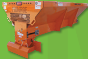
SPREADER | MIDSIZE