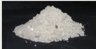
AFTER Salt Slurry Generator